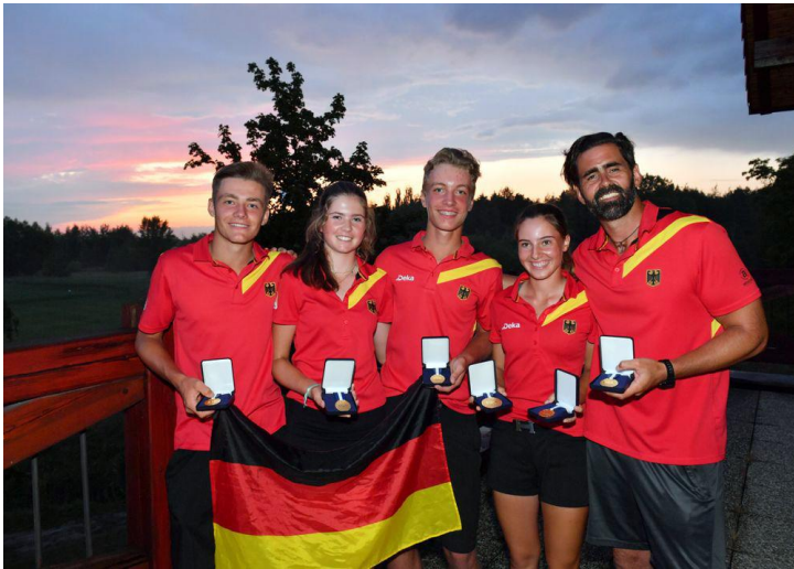
The 2019 European Young Masters winning team - Germany