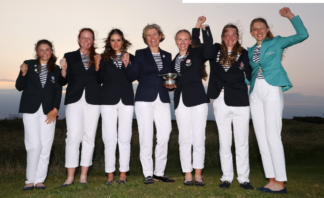
Winners Junior Vagliano Trophy 2024 Great Britain & Ireland