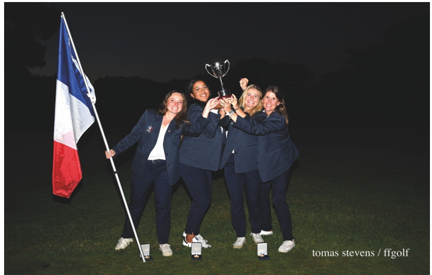
tomas stevens / ffgolf